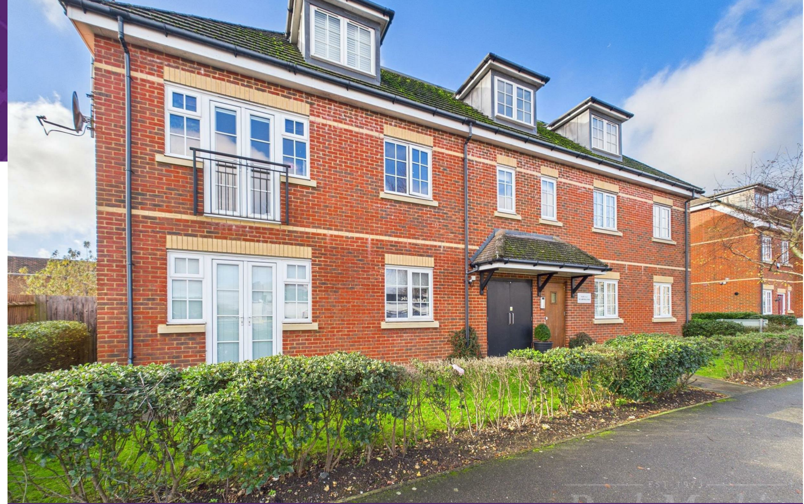
EST 1973 Paul Meakin £250,000 Limpstead Road, South Croydon, CR2 9EE ESTATE AGENTS